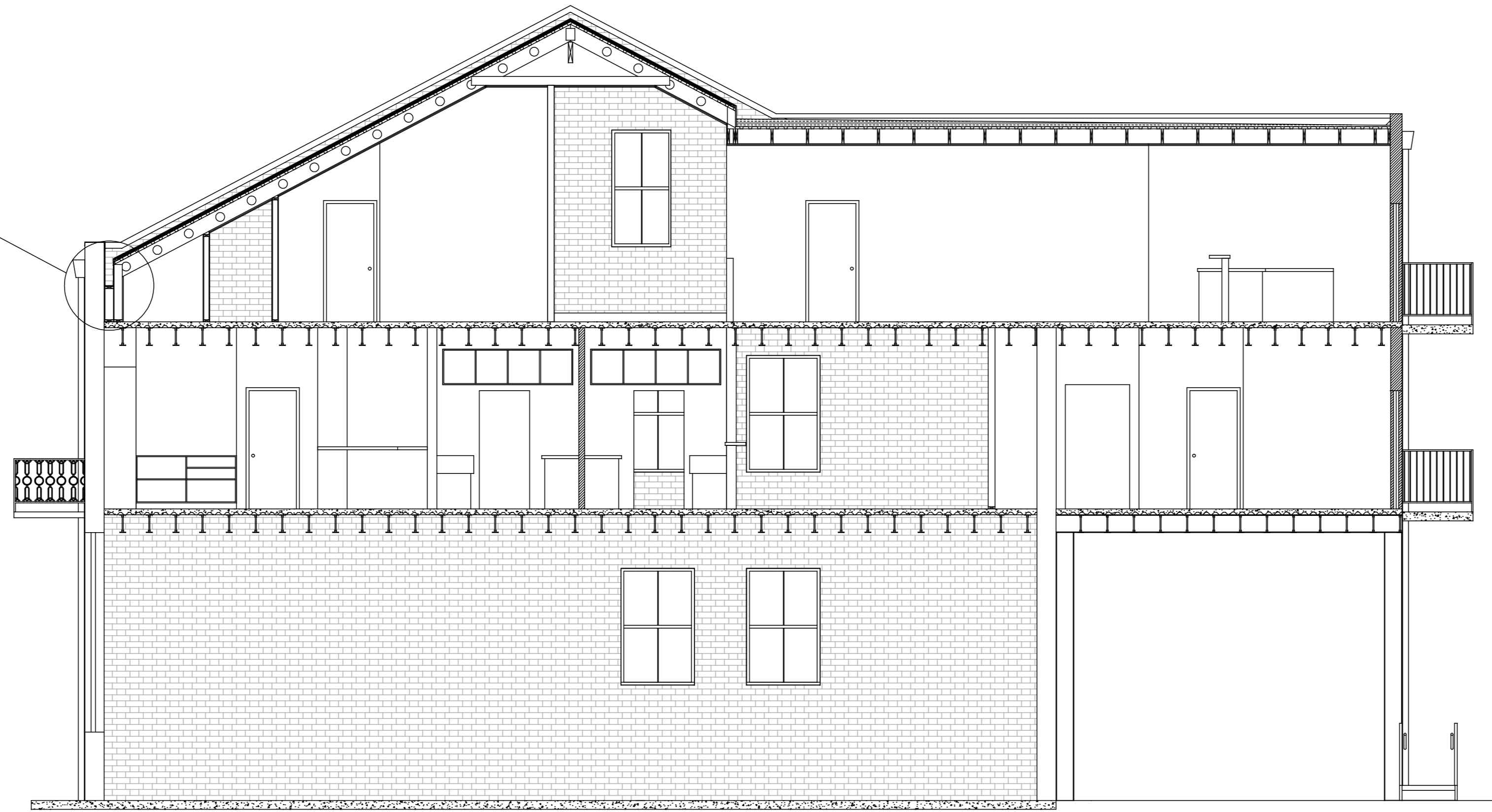
2 LONGITUDINAL SECTION SCALE 3/16" = 1'